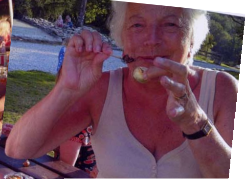
← Plate of barbecued snails