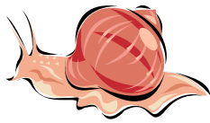
Around the world in 80 dishes ! Barbecue French Style - always make a point of trying the local delicacies!!