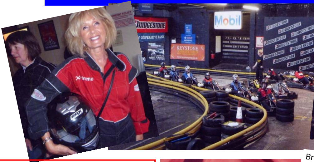
Our intrepid senior vice tries go-carting at Stoke on Trent with Hope Valley Rotarians. At one stage she held the lap record