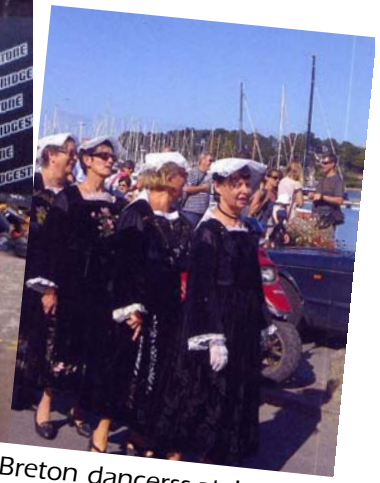
Breton dancers at LaTrinite sur Mare