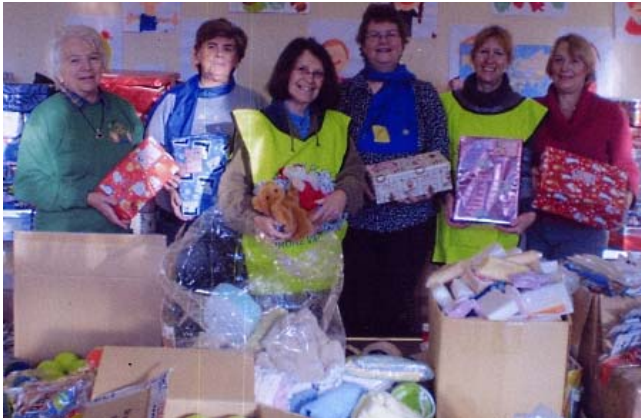
A really busy weekend on Sat. and Sun, Nov. 19/20, as we checked, sorted and packed over 680 shoeboxes.