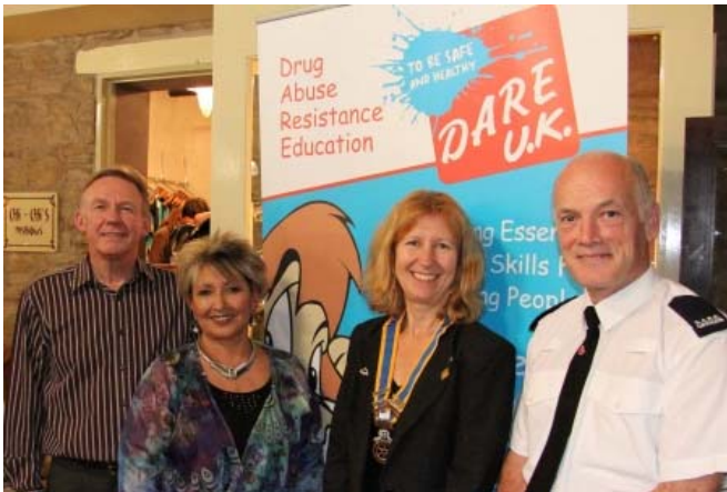
A very successful Fashion Show was arranged by Chi Chi and Blush, with help from many other shops at the Forge in Dronfield.. Over £800 was raised to support the DARE project which we are to run next year.

4 Schools are already 'signed up' to start the 10 week course at the start of next term, a total of 110 children. 3 other schools are hoping to join later in the year.