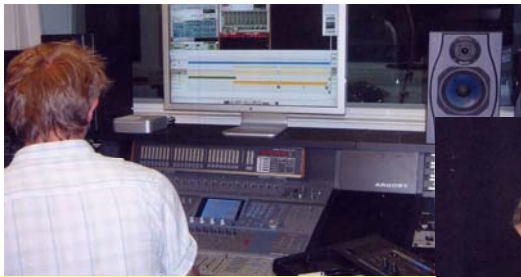
Recording studio control room at DCAS

facilities like this, the new crowd is going to have a ball!