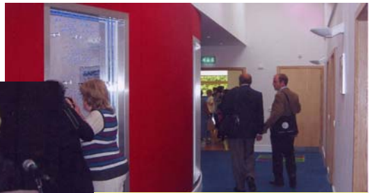
Its bright and cheerful in 'Fairplay'